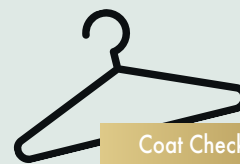
Coat Check Sponsor