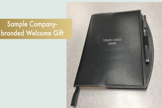
Sample Company-branded Welcome Gift