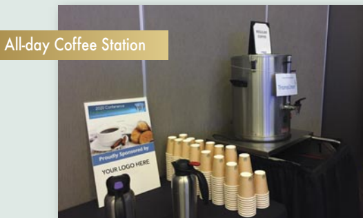
All-day Coffee Station