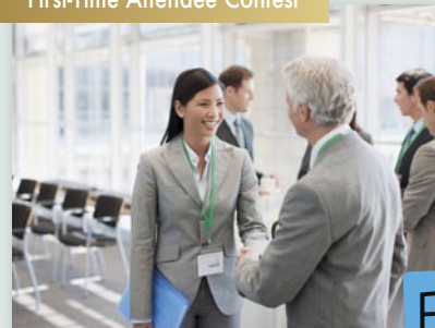
First-Time Attendee Contest