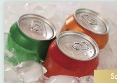
Soda Pop Station