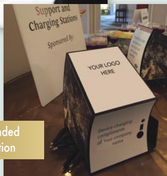
Company-branded Charging Station