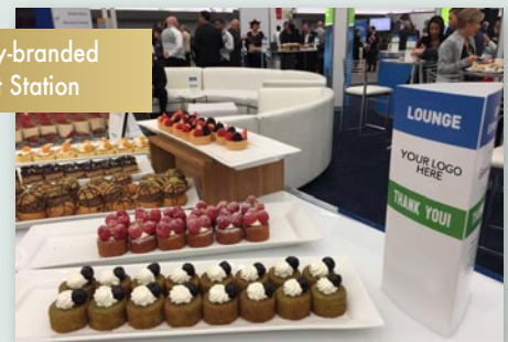
Company-branded Dessert Station