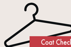
Coat Check Sponsor