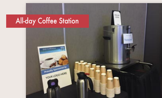
All-day Coffee Station