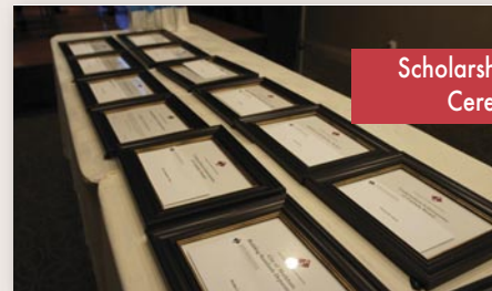
Scholarship Awards Ceremony