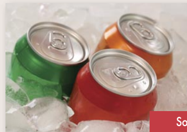
Soda Pop Station