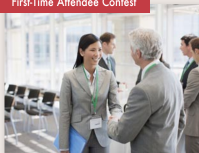
First-Time Attendee Contest