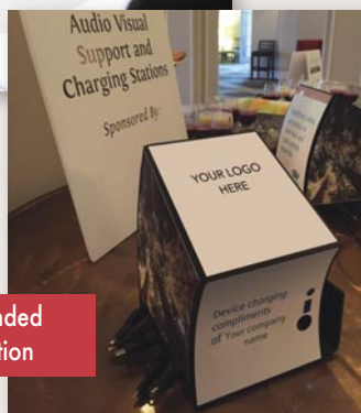
Company-branded Charging Station