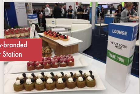
Company-branded Dessert Station